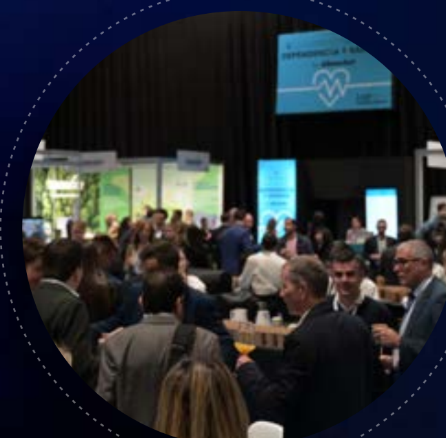
DEPENDENCY AND HEALTHCARE NETWORKING