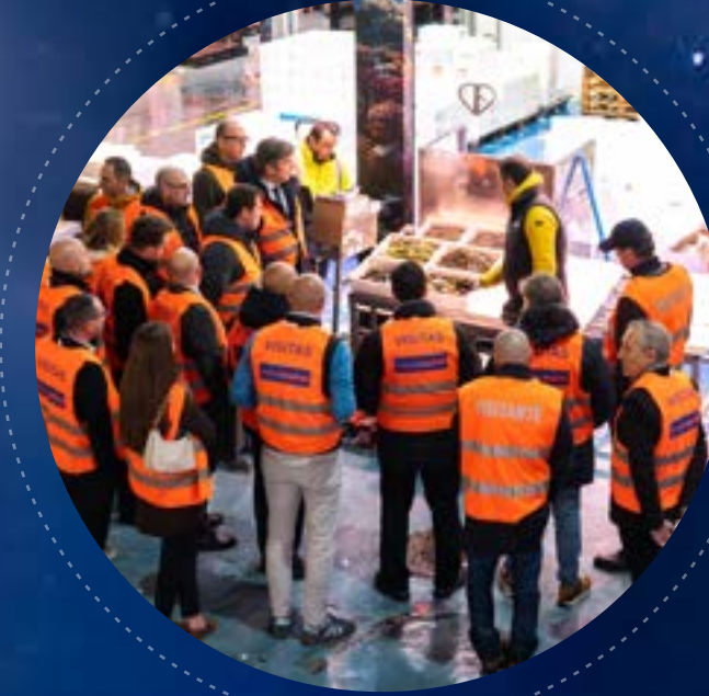
F&B TOUR EXPERIENCE