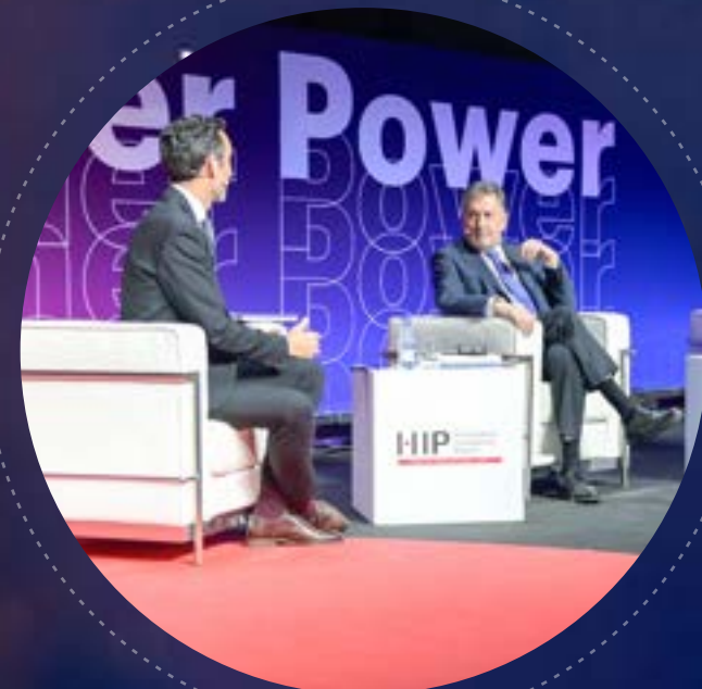
THE VIP ROOM HOTEL TRENDS