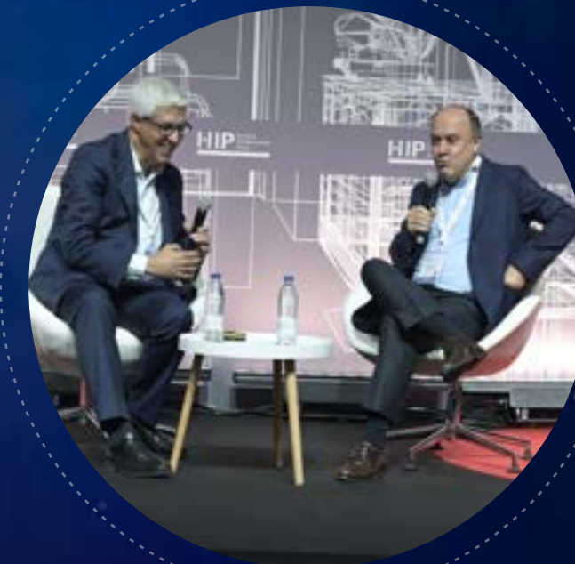
SUPPLY CHAIN MEETING