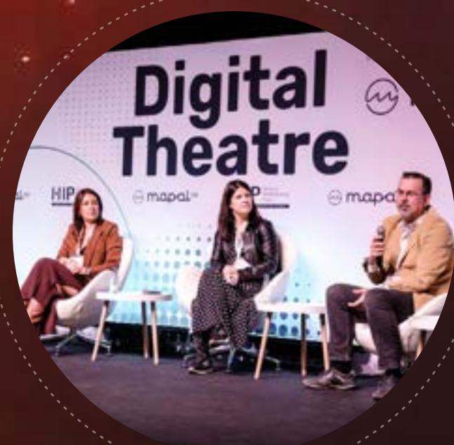
FUTURE GASTRONOMY STARTUP FORUM