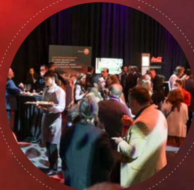
RESTAURANT TRENDS ANNUAL MEETING